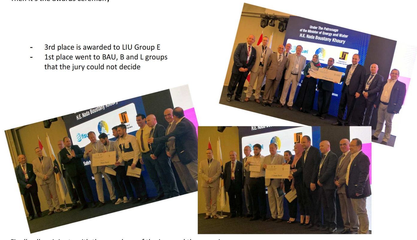
Finally all recipients with the members of the jury and the organizers.

The presentations of each group of students are available on Fisuel's website (www.fisuel.org). Then it's the awards ceremony