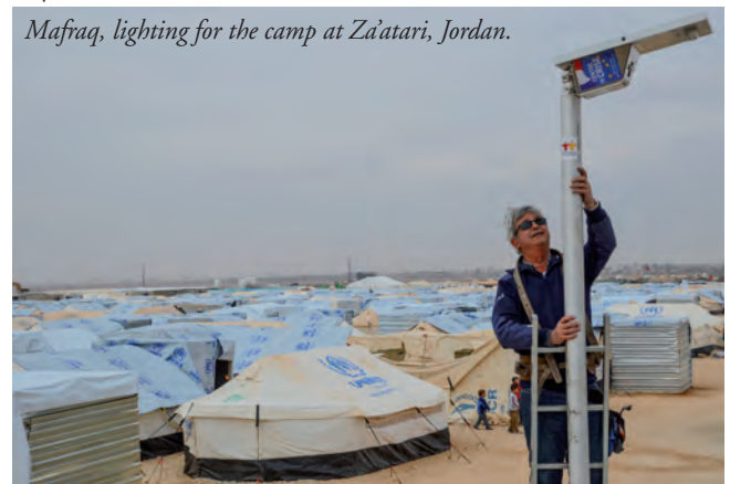
Mafraq, lighting for the camp at Za'atari, Jordan.

The actions of "Electriciens sans frontières" are made possible through the support of public and private participants, men and women who invest in favour of energy for all. Some of these provide financial support, others encourage their employees to support the work or becoming actively involved. Others raise awareness among their customers and suppliers about the actions undertaken in favour of access to energy supplies. "Electriciens sans frontières" ensures that appropriate, customized solutions are proposed which meet the particular motivations and expectations of each case.