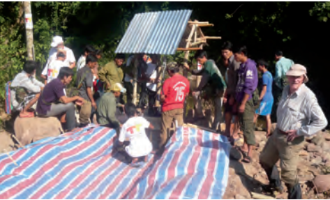
Green energy for 30 provincial villages. People's Democratic Republic of Laos.

been working since 1986 to reduce world poverty through energy access projects.