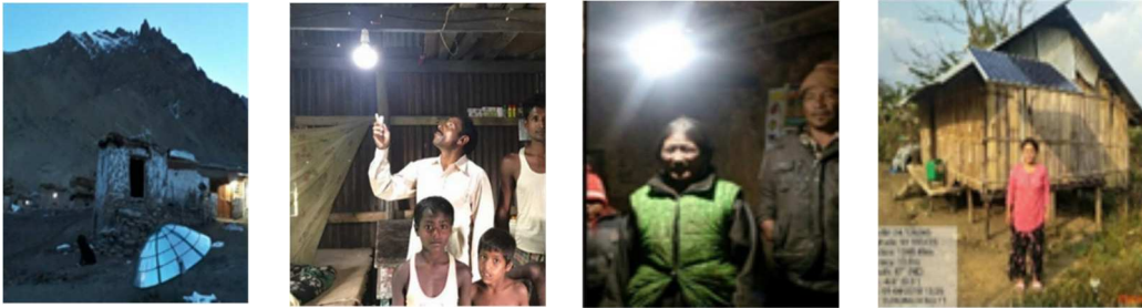
Figure 5: Solar-DC technology is conquering the terrain challenges and powering off-grid homes in the most remote areas of India

Figure-5 shows Photographs of solar-DC systems deployed in different regions of India which were previously off-grid.