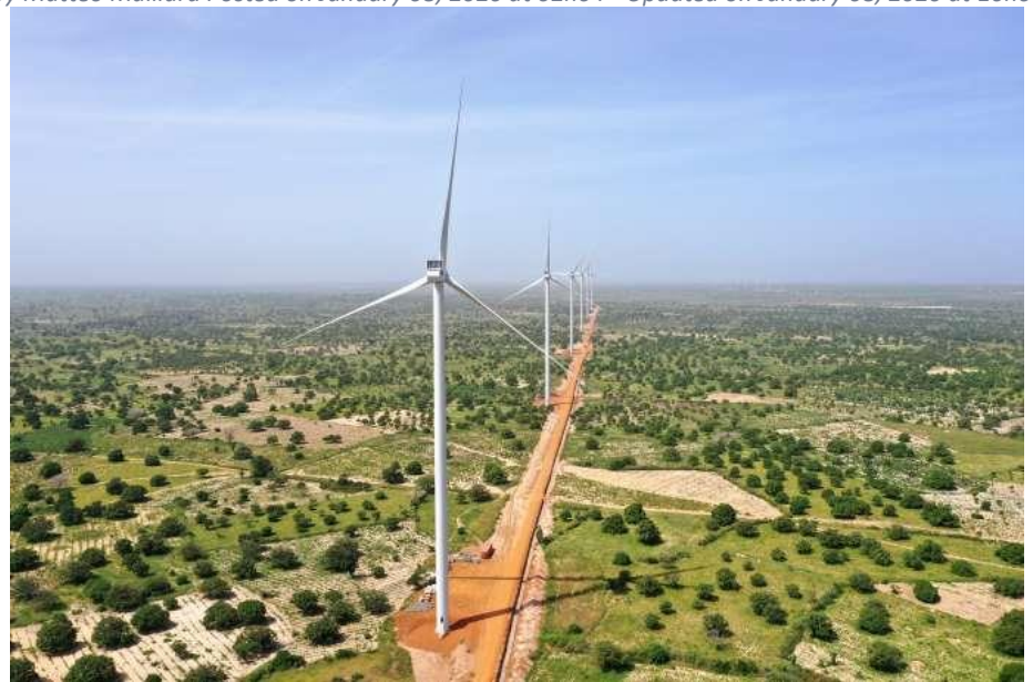
Taiba NDiaye wind farm is the largest farm in West Africa, designed to generate electricity for at least 20 years.