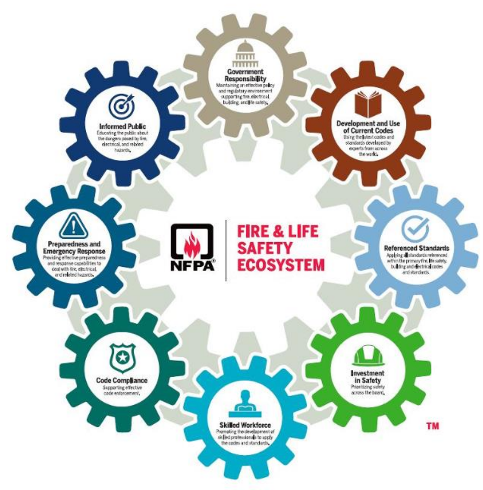
Figure 5: The Fire and Life Safety Ecosystem

The main "cogs" when producing countries that are safer in terms of fire are: