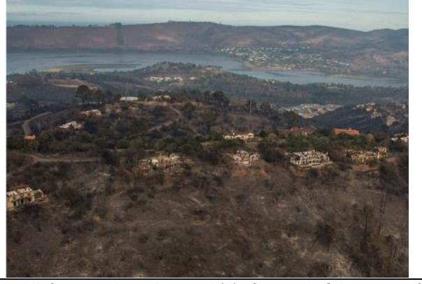
Figure 2 (a) Fire disaster in Imizamo Yethu (Cape Town, South Africa) which left 10,000 homeless, and (b) aftermath of the Knysna fire disaster which destroyed almost 1000 homes

<u>Statistics</u> from South Africa (which typically has a more developed economy and better enforcement of building construction standards than its neighbours) indicate the number of fire deaths reported by fire brigades is increasing at around 5-10% per annum (but based on mortuary data the total number of people killed in fire related incidents could be as many as 4-5 times higher than this, as many people die in hospital after an incident, which is not reported in brigade statistics). Fire statistics from most developed nations shows an opposite trend than in developing countries. The US has seen a decrease in home fire deaths of 55% from 1977 to 2017. England has seen a decrease in fire deaths in dwellings of 55% from 1980 to 2018.